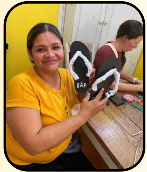
Contributed to Serving to the Deaf MEXICO

Use the order form for your selections, or call our office at 816-431-6217 .