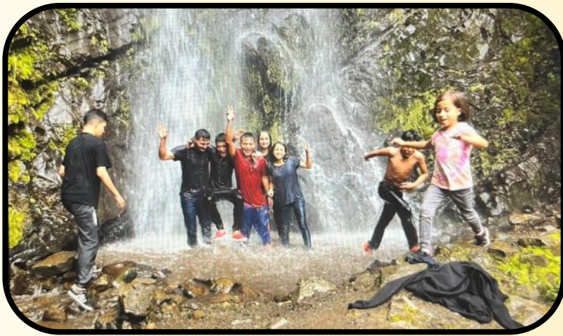
Supported Foster Care for Orphans ECUADOR

As you look through the catalog, consider what captures your heart and how you can help. Include your children, grandchildren and other family members. Touching the lives of people less fortunate is an awesome lesson to model with your family or share with your group at Christmas. It's amazing how our gifts can reflect the love of God!